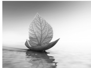
Storm water management helps protect Lake Washington.

jects proposed in the Town's Comprehensive Storm Water Management Plan completed by ESM Consulting Engineers in January 2008.